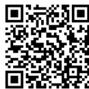
Website of the Nagaoka University of Technology