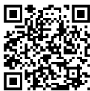
Website of the National Institute of Technology (KOSEN)

National Institute of Technology (KOSEN), Fukushima College