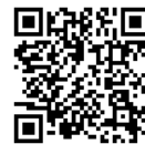
Website of the National Institute of Technology (KOSEN), Fukushima College