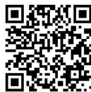
Website of the Toyohashi University of Technology